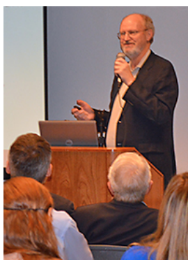
Dr. Robert Grubbs, Nobel laureate and Entrepreneur